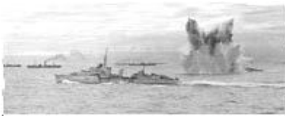
Arctic Convoy bombed

An anti-aircraft gunner who was on service on the high-octane tanker the steamer Bolton Castle which was